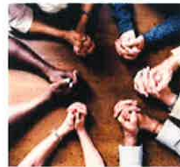
First week after Trinity